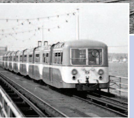
A seven-car electric train heading outwards on the Southend Pier Railway in the late 1950s.

Left: Two of the three Mid-Suffolk Light Railway 0-6-0Ts which became LNER J64 class at Laxfield in the early 1920s.